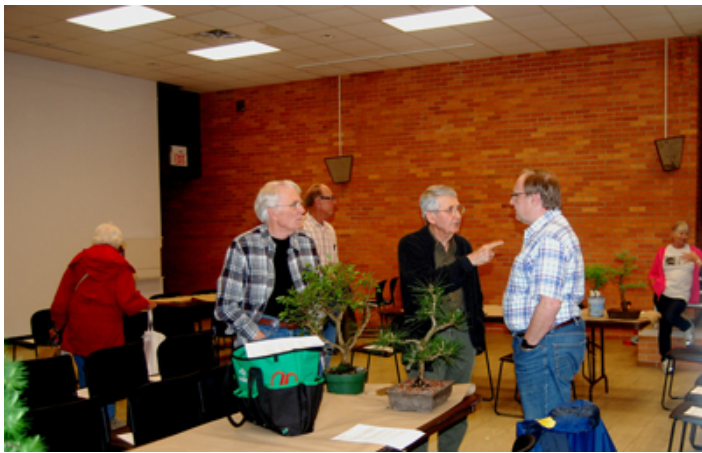
Some BYOT participants